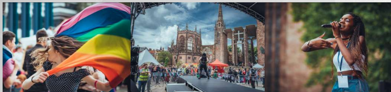
Coventry Pride 2019

Supporting Coventry Pride demonstrates your commitment to diversity and inclusion, and the LGBT+ community, all year round.